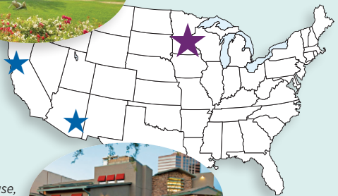
Ryan House, Phoenix, AZ