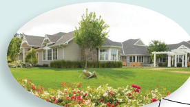
George Mark Children's House, San Leandro, CA

Crescent Cove will be the third dedicated children's respite and hospice care home in the United States, serving patients across the Midwest.